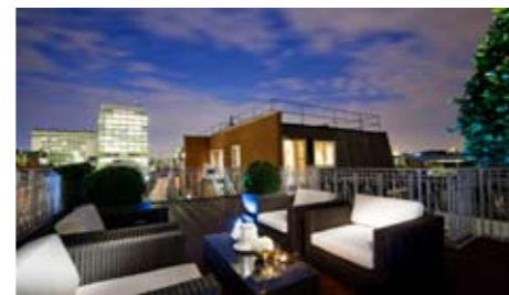
Penthouse Perfect St James

Made exclusively in Italy by artisans, Sermoneta produce the highest calibre of gloves using only the finest leather, suede, silk and cashmere. With 2 collections each year, Sermoneta is a name that has become as synonymous with variety as it has quality, with over 70 brilliant hues and many linings. A fitting service is provided throughout the store to ensure patrons find the perfect pair.