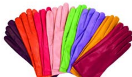
Sermoneta Gloves, Burlington

Hotel Verta lands at The London Heliport this autumn and will be the first integrated hotel heliport solution in the world. Part of von Essen hotels collection, Hotel Verta is the group's first London hotel and the first hotel in the Metropolitan Set. Everything at Hotel Verta, from the unique location on the Thames, to the stunning architecture and cutting edge technology, is there to ensure that guests, whether business or leisure, have their every expectation exceeded. The hotel's design, inspired by the Halcyon days of aviation, combines timeless elegance with modernity.